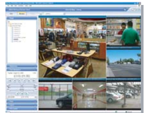
NetGuard browser-base video client. Up to 4x4 cameras in live and investigation modes, with no software installation required. For all OnSSI NVRs.