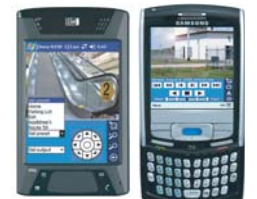
NetPDA and NetCell handheld video clients*. For NetDVMS and netDVR Only.