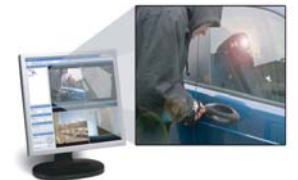
NetMatrix Intelligent Viewing add-on. Enables manual sending and automated push of events to user's screens. For NetDVMS and NetDVR only