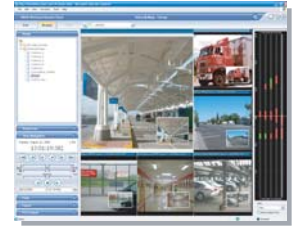
NetGuard-EVS advanced video client, for live monitoring and after-the-fact investigation of up to 64 cameras. For all OnSSI NVRs.

OnSSI's NVRs were designed to provide instant access to events and automated delivery and display of events and exceptions. Incorporating motion detection and motion smart search, automated push-video of live events, and through integration with access control integration and advanced Video Content Analytics (NetDVMS only), fewer operators than ever before to effectively monitor large camera systems.