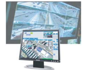
NetSwitcher control room video wall matrix switch. Optional; compatible with NetDVMS and NetDVR.