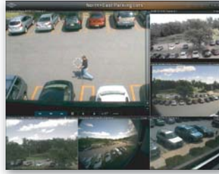
Live Monitoring Assisted by instantaneous playback, optical PTZ and digital PTZ