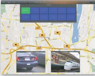
Map-Based Navigation For desktop and video wall management