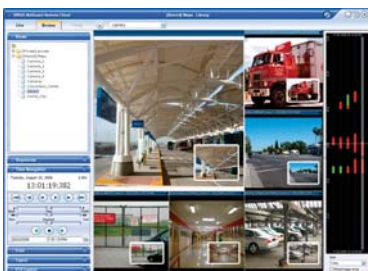
NetGuard-EVS Graphical motion detection timeline and PIP (Picture-In-Picture) assisted PTZ