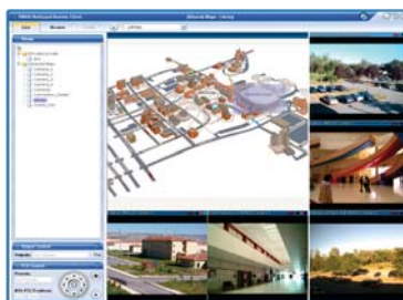
NetGuard Remote Client Configurable shared and private views for easy access to cameras