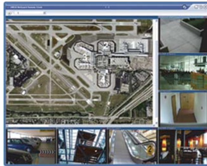
NetGuard-EVS - Live View with Map-Driven Interface

Distributed Access to Video NetDVMS serves as a gateway to multiple video clients. OnSSI's intuitive map-driven remote client, NetGuard-EVS, provides access to multiple cameras from multiple NetDVMS servers. Multi-grid view-sets and static or active-HTML map-driven interfaces allow instant access to view-sets or cameras. NetGuard-EVS enables multiple screen display, video on alarm, carousel display, Alert View and hotspot functionalities. Any number of Alert View windows can be assigned in the video grid, for receiving Push Video on event; and video from any camera can be manually pushed to other NetGuard-EVS clients, NetMatrix Viewers or NetSwitcher displays, directly from NetGuard-EVS. Powerful investigation tools include time-synchronous video viewing and playback, motion smart search, event generation, and digital PTZ into playback.