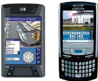
NetPDA & NetCell PTZ-enabled Handheld IP Video clients/controllers

All of OnSSI's remote access solutions incorporate a multi-tiered access authorization scheme, allowing the system administrator to assign or restrict use, by specific camera and function, for individual users.