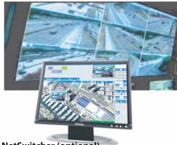
NetSwitcher (optional) Virtual video matrix switch software platform