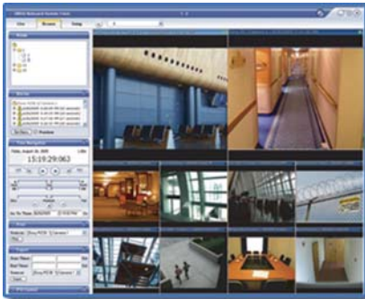
NetGuard-EVS - Multi-Camera Synchronous Playback